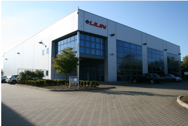
LILIN UK Office, Milton Keynes.

LILIN are a global manufacturer of CCTV products, with 500 employees across 10 branch offices worldwide, providing local market understanding and support.